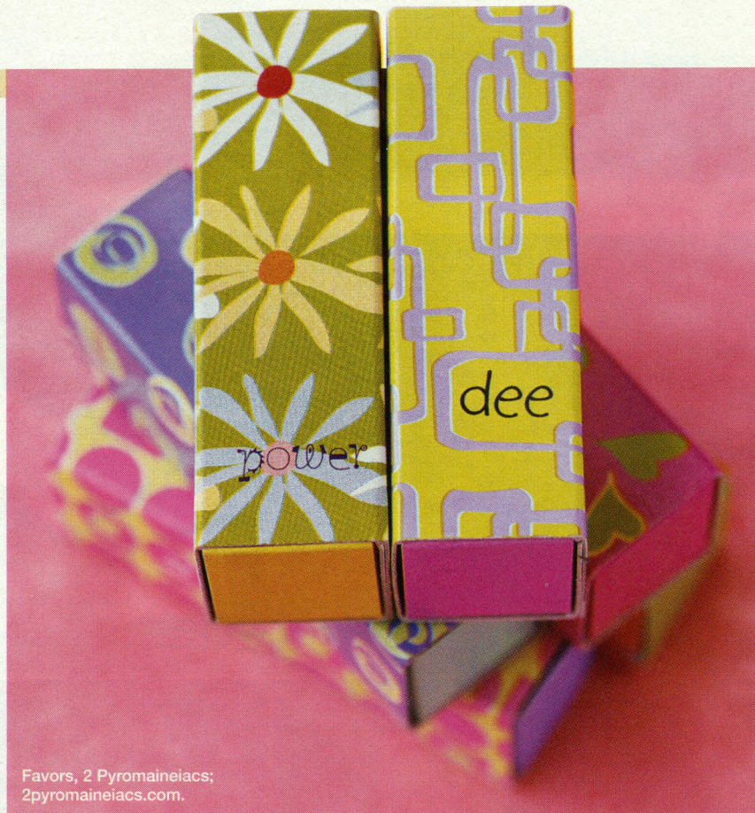
Favors, 2 Pyromaineiacs; 2pyromaineiacs.com.

idofoundation.org This site's Favors for Charity program lets you make a donation to your favorite