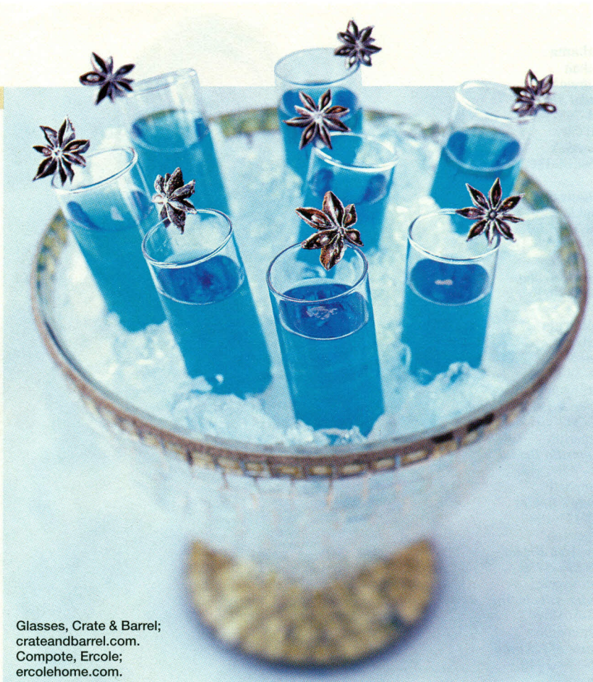
Glasses, Crate & Barrel; crateandbarrel.com . Compote, Ercole; ercolehome.com .

rentalhq.com Find local party-rental stores, plus lots of tips from the