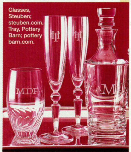
Glasses, Steuben; steuben.com . Tray, Pottery Barn; potterybarn.com .

beau-coup.com This dot-com sticks to one irresistible specialty: favors. Feeling overwhelmed by all the elegant options? Click on New Products and Bestsellers for some of our top choices, (Continued on page 366)