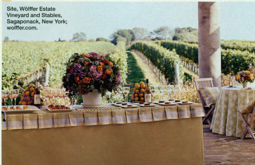
Site, Wölffer Estate Vineyard and Stables, Sagaponack, New York; wolffer.com.

www.poets.org What better place than your wedding to bring poetry to the masses? Search for more than 1,200 poems by key word or poet to hit on the perfect verse. weddingministers.com This directory includes more than 3,000 ministers, priests, rabbis, and justices of the peace in the U.S. Select vows and readings, and learn how to choose the best officiant for your ceremony. (Continued on page 356)