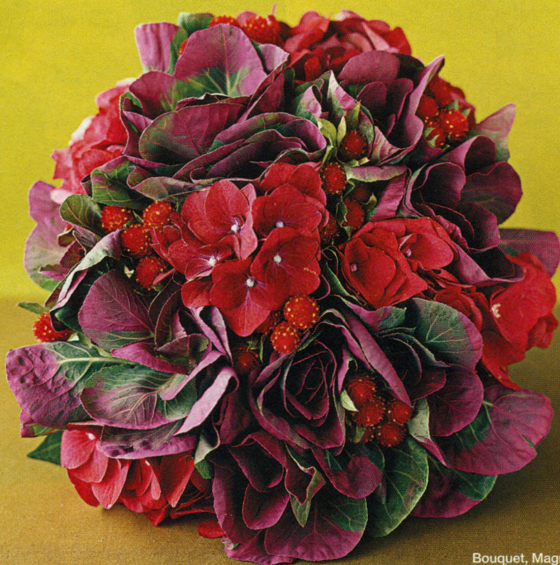
Bouquet, Magnolia; magnolia-nyc.com